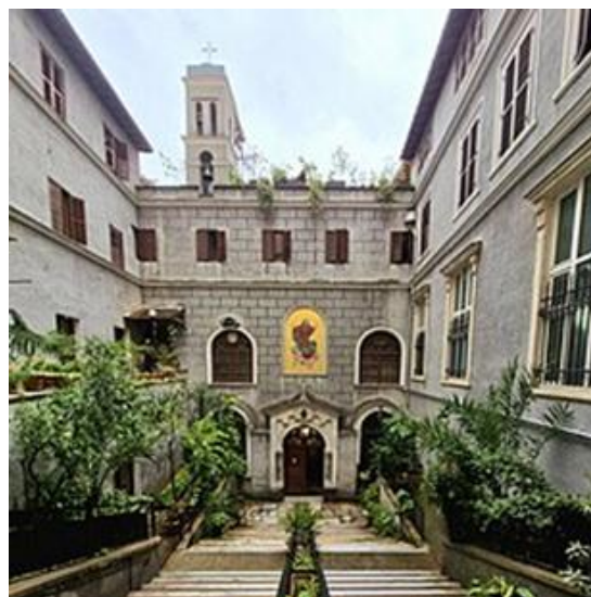
Register of baptisms 1765-1794, Santa Maria Draperis church, Istanbul