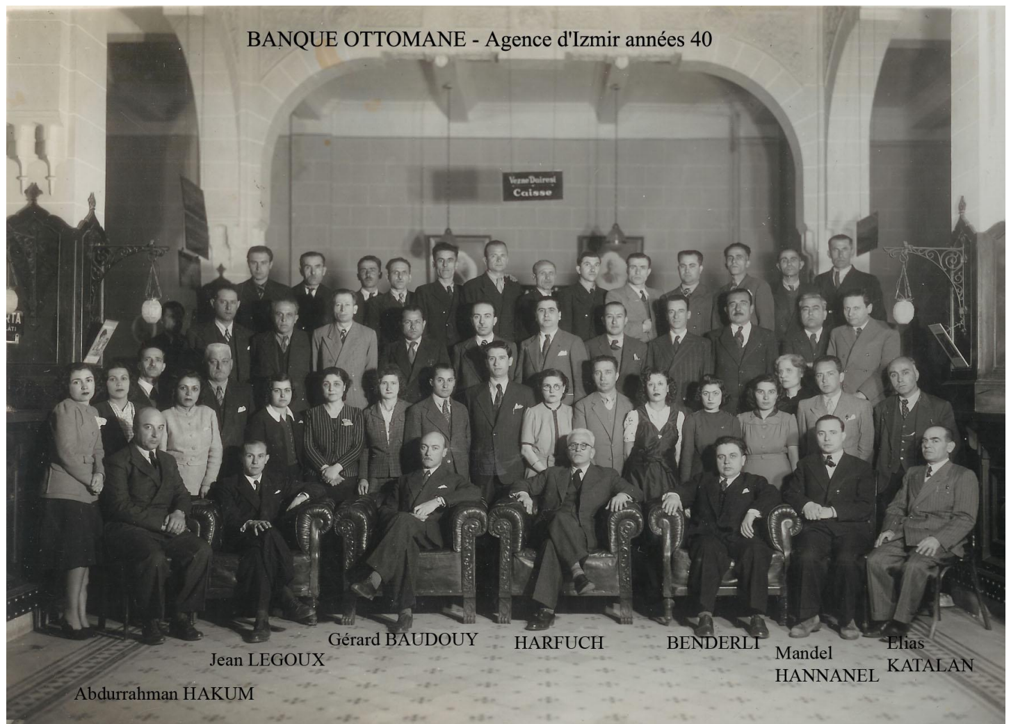
with names added. We seek additional names, information and other similar photos – gallery of former Ottoman bank staff and branches.