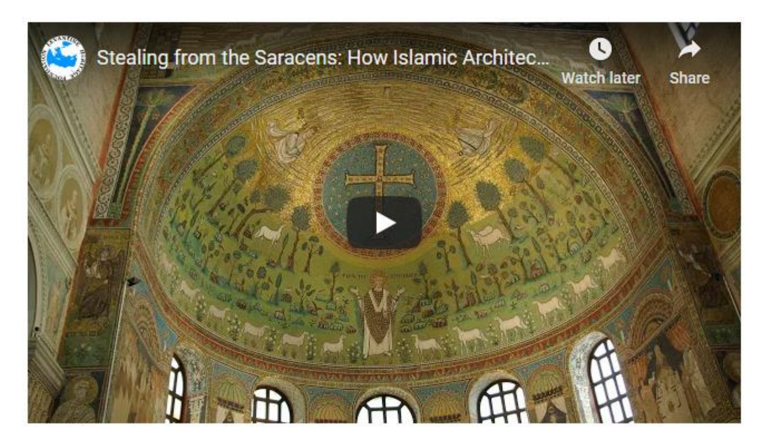
2nd LHF online presentation with guest speaker Diana Darke: 'Stealing from the Saracens: How Islamic Architecture shaped Europe', 16 December 2020 - flyer: - flyer: - slides: - <u>video:</u>