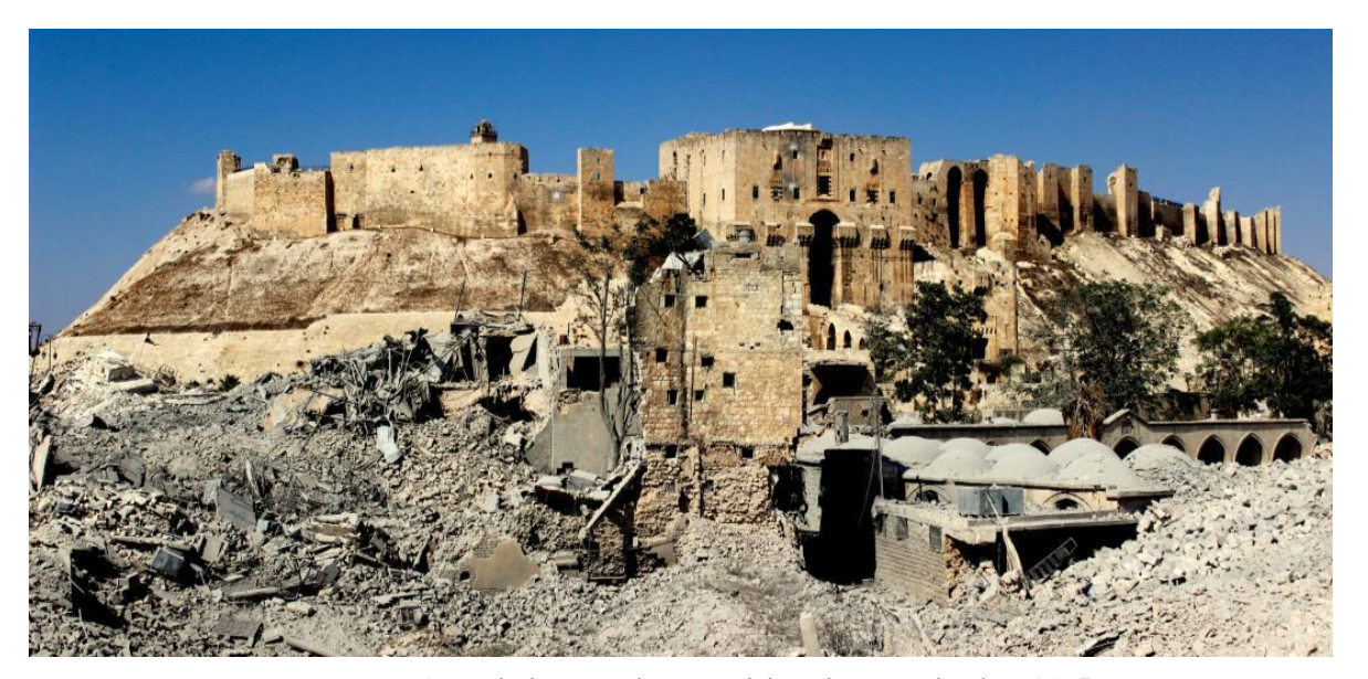
Central Aleppo with its citadel as they stand in late 2015