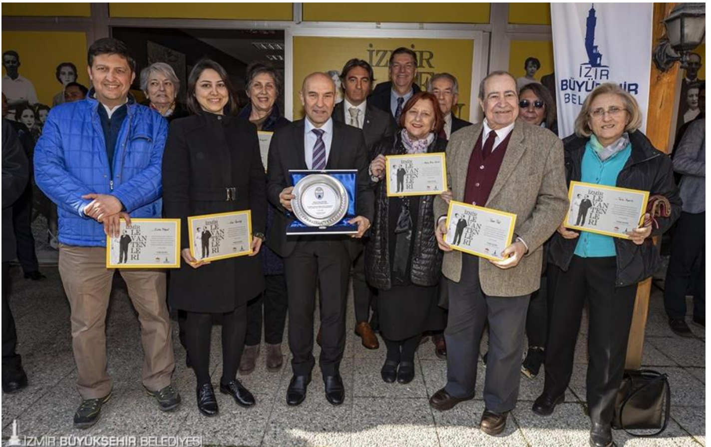
The opening of the 'İzmir Levantines' exhibition at Apikam, İzmir 10 February 2020 - gallery :