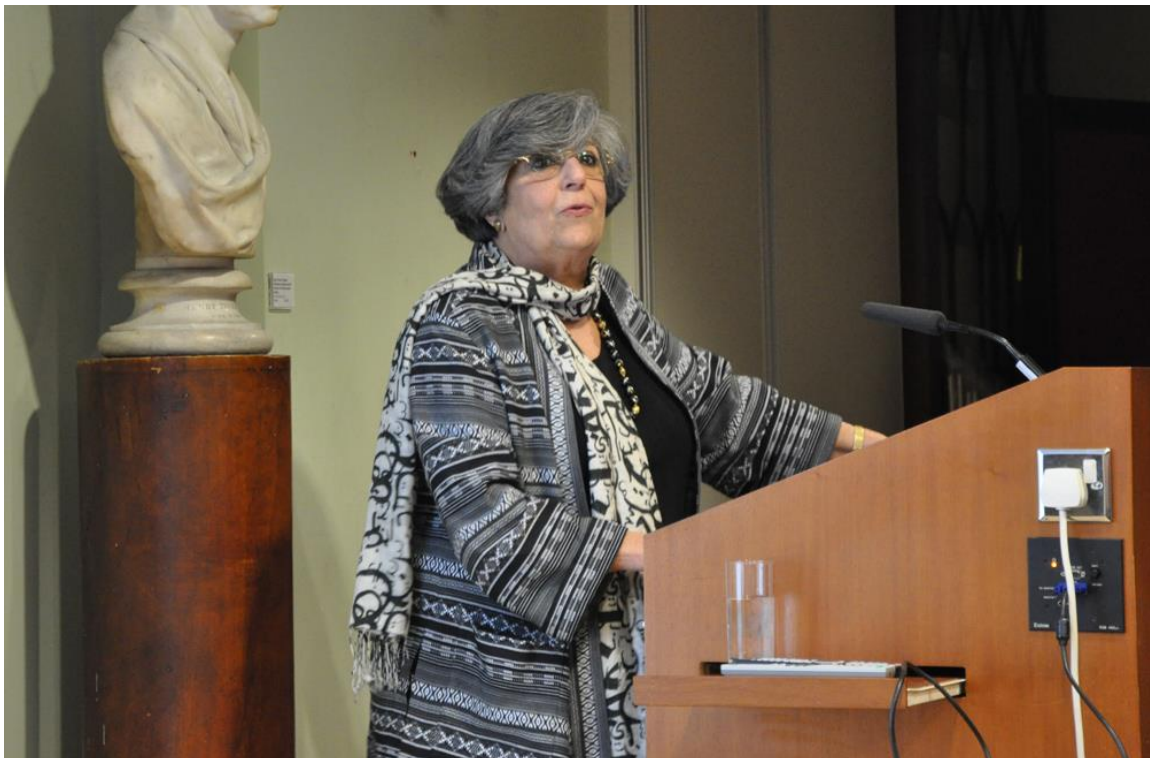
Joint event with the Egyptian Cultural Centre, London: Lecture by Prof Doris Behrens-Abouseif: 'Cairo through the lens of pilgrims and explorers from the Middle Ages to Napoleon', 15 January 2020 - flyer : - video :