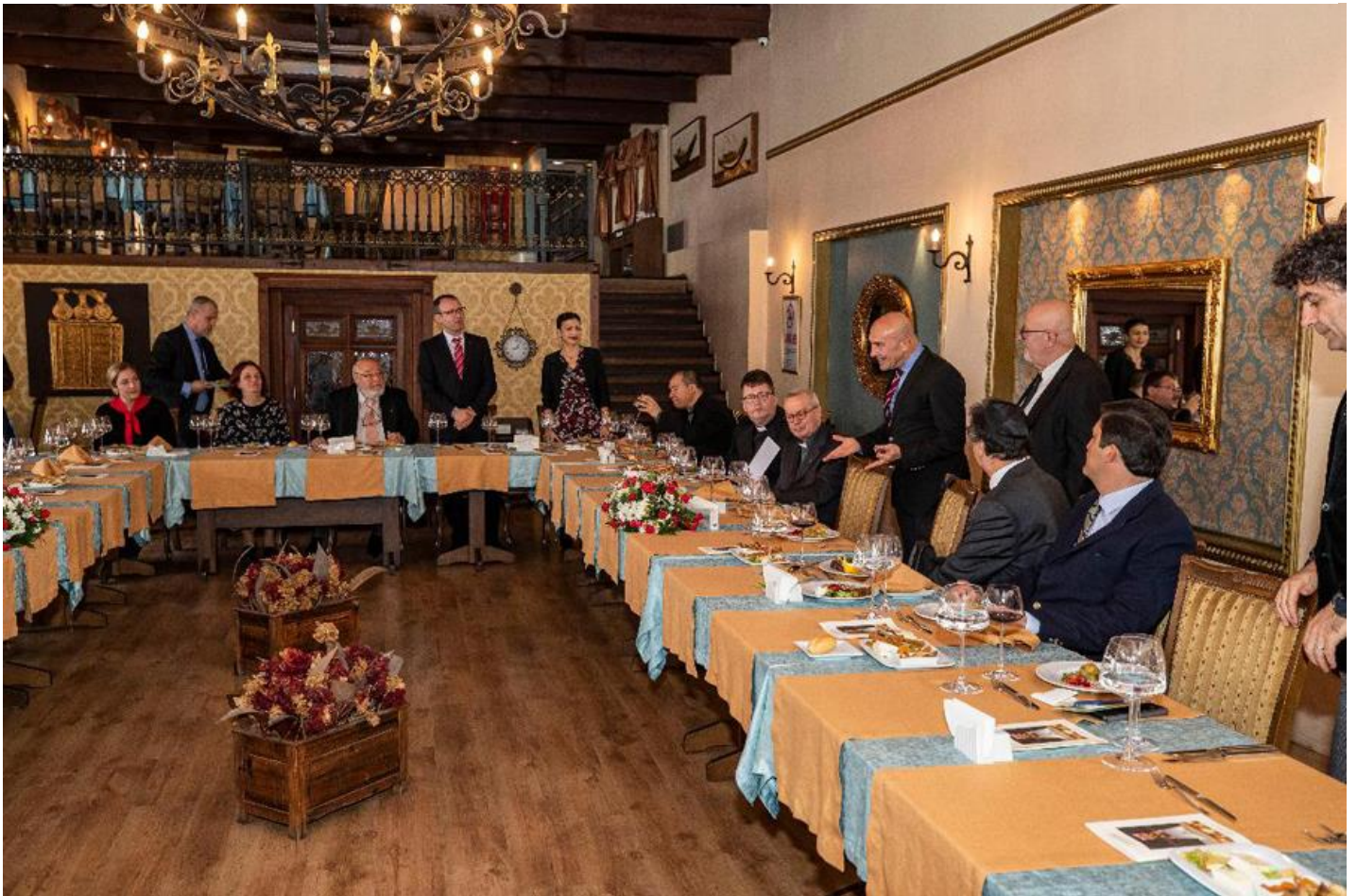
The lunch reception given by the mayor of Izmir Tunç Soyer at the historic elevator building in Karataş on 20 December 2019, welcoming the diverse community members of the city including a contingent of 10 Levantines of Izmir – gallery :