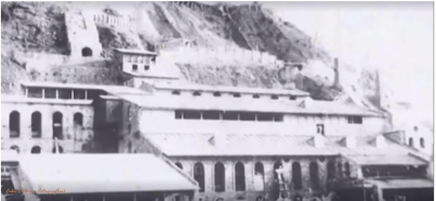
Archive view of the port Göçek with the wharfs for exporting chromium ore from the nearby Paterson mines.

I have currently been on a field work to find the Paterson mines in and around Muğla-Fethiye-Köyceğiz. I was only able to find some ruins and couple of photographic evidences. The information on the location of the factories, houses and mines in Western Anatolia would also be very helpful as I am currently marking them on maps. I would appreciate any help members and friends can provide in this field. isilaysheridan@gmail.com