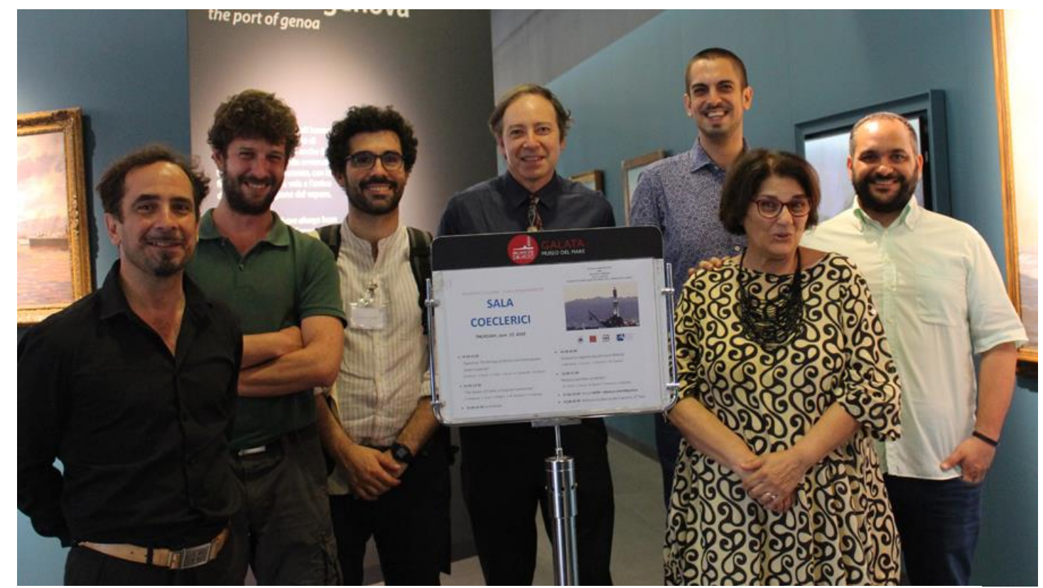
2nd roundtable of LHF-Italy on the occasion of the conference: Between Immigration and Historical Amnesia, 27-29 June 2019, Galata Naval Museum, Genoa, Italy - <u>programme:</u> - <u>gallery</u>:

31st Levantine Heritage Foundation lecture & dinner gathering in London with guest speakers Gareth Winrow: 'Patriot and Liberal Internationalist? The Life of Ahmed Robenson' and Prof Gerald MacLean: 'Ottoman Aleppo Through British Eyes' – 24 July 2019, 6 pm – flyer: - video1, 2