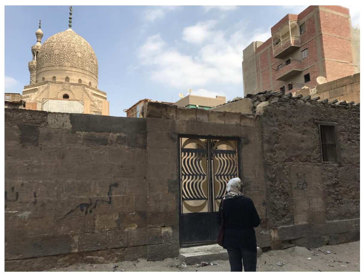
Entrance gates to the mausoleum mosque of Qait Bay, Hawsh, Cairo.