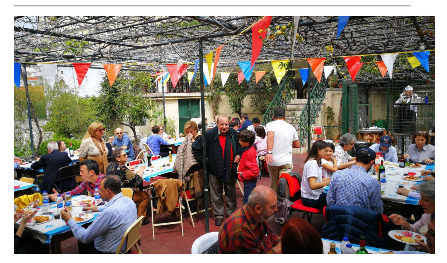
Members and friends of the Izmir Levantine Foundation enjoy the Easter meal, 1 April 2018