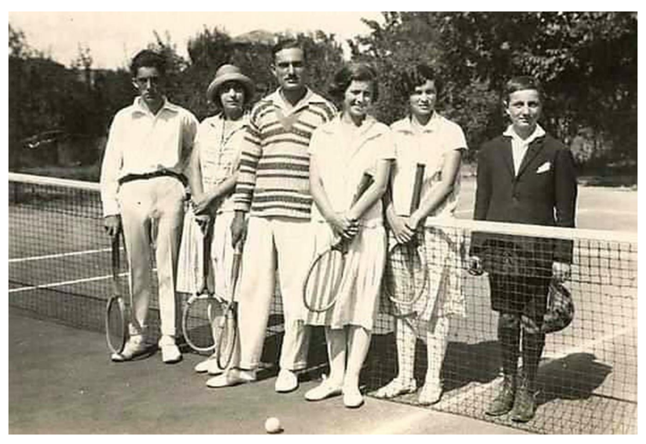
Caption is Moda tennis club, 1929. Can anybody recognise any of the characters?