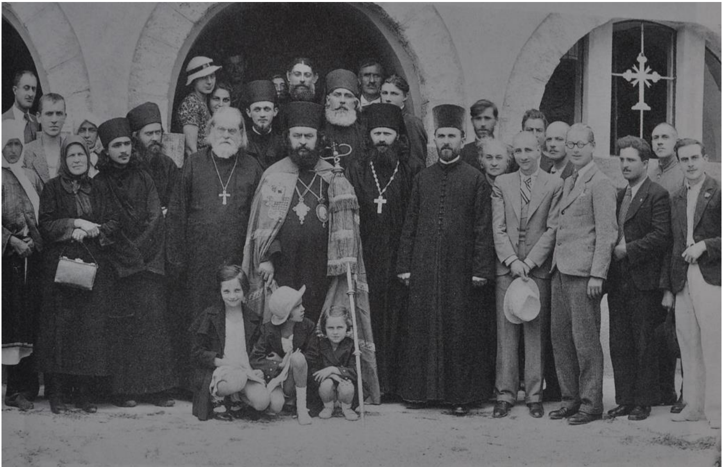
A group of Russians in front of a charitable institute for the poor in Galata, 1930