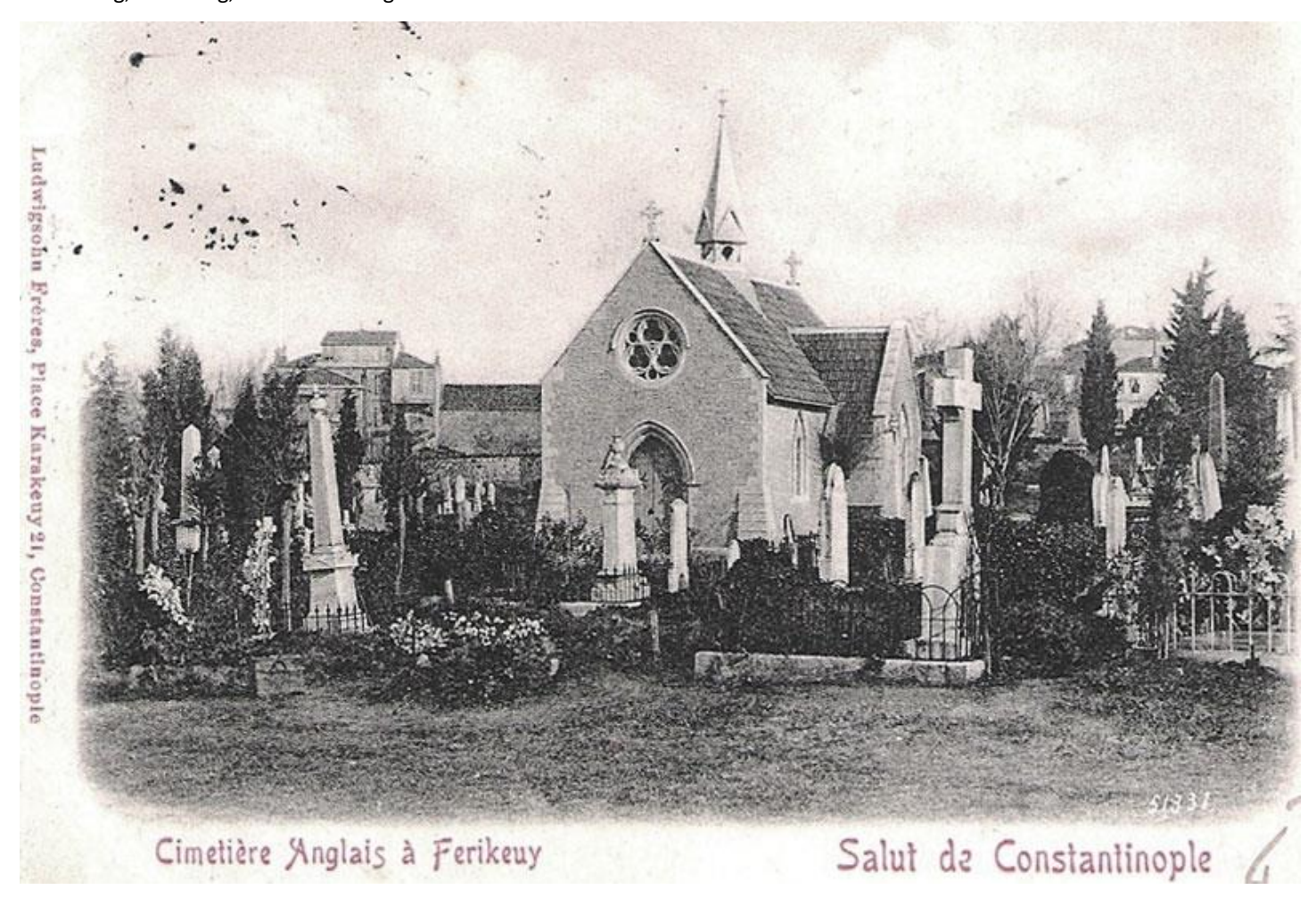
An \ archive \ postcard \ view \ of \ the \ central \ chapel \ and \ the \ British \ section \ of \ the \ Ferikoy \ Protestant \ cemetery.

Today, the Feriköy Protestant Cemetery Initiative aims to preserve, document, and study Istanbul's main Protestant cemetery as an important local historic landmark. It was founded in 2018 by scholars affiliated with the American Research Institute in Turkey (ARIT); the Netherlands Institute in Turkey (NIT); and the Orient-Institut Istanbul, and joined in 2019 by the Hungarian Cultural Center and the Swedish Research Institute in Istanbul (SRII). These five Istanbul-based research centers share the common goal of conserving, recording, and researching the site.