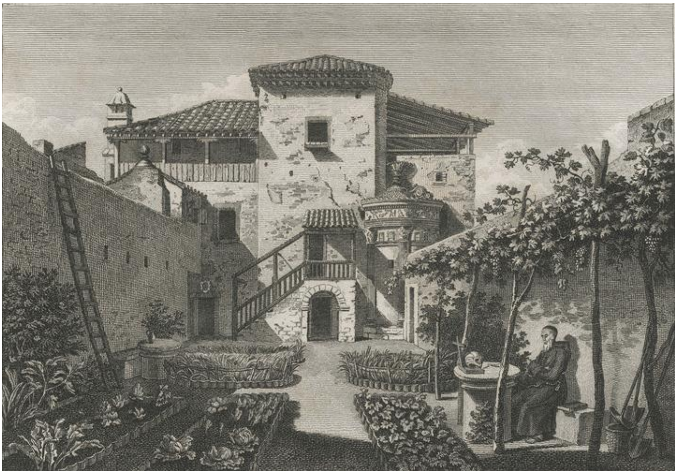
The Choregic Roman Monument of Lysicrates seen from the court of the hospice of the Capuchin monastery, where it was situated and integrated into the building as its library. A Capuchin monk is seen sitting in the garden. This monastery like most of Athens was completely destroyed in the chaos of the Greek revolution of 1821. The engraving is from a book dating from 1808, Les Antiquités d'Athènes , J. Stuart and N. Revett.

The tour will end at the Damigos' Taverna one of the oldest in Plaka, or at nearby Saita. Guests may join us for a meal where each pays for their own.