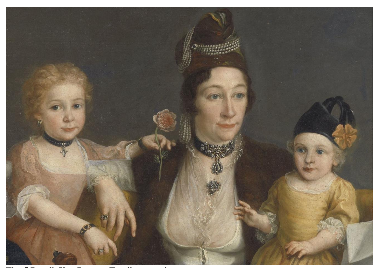
Fig. 5 Detail, Van Lennep Family portrait