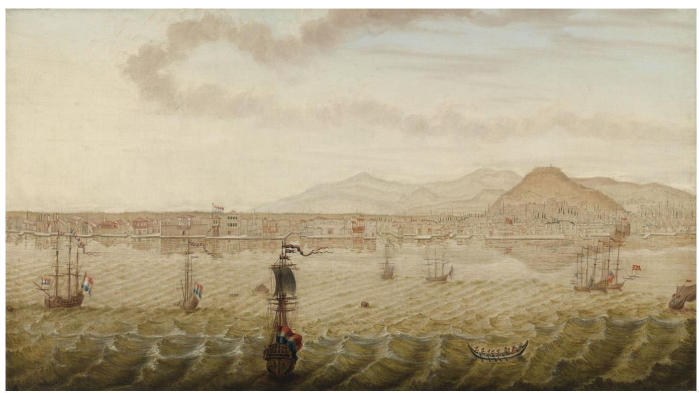
Fig. 2 N. Knop, View of Smyrna (Izmir) , showing Dutch ships in the harbor, 1779, Rijksmuseum