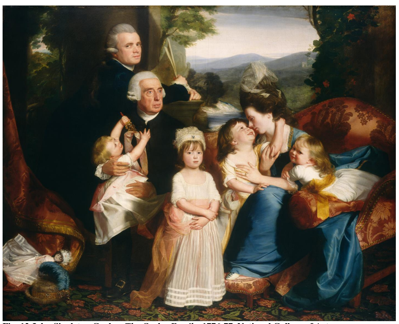
Fig. 12 John Singleton Copley, The Copley Family , 1776-77, National Gallery of Art, Washington, DC