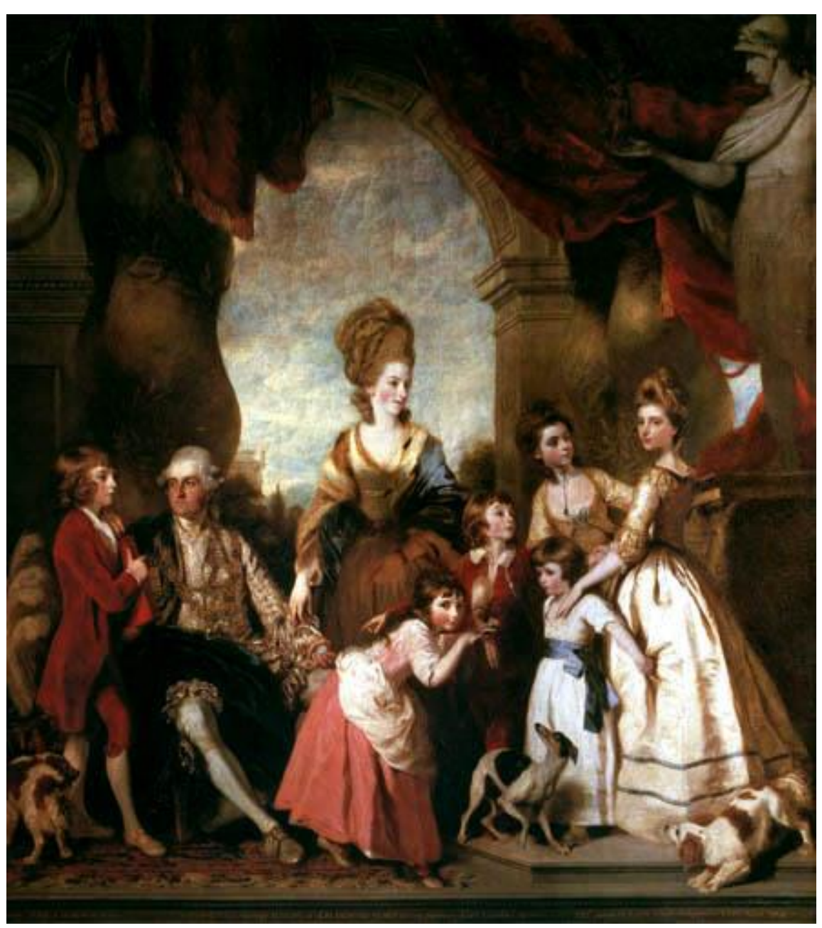
Fig. 13 Sir Joshua Reynolds, The Family of the Duke of Marlborough, 1778, Blenheim Palace, Oxfordshire