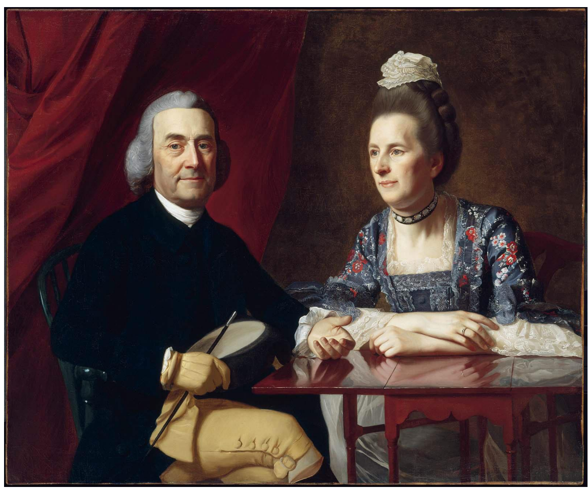
Fig. 10 John Singleton Copley, The Isaac Winslows , 1774, Museum of Fine Arts, Boston