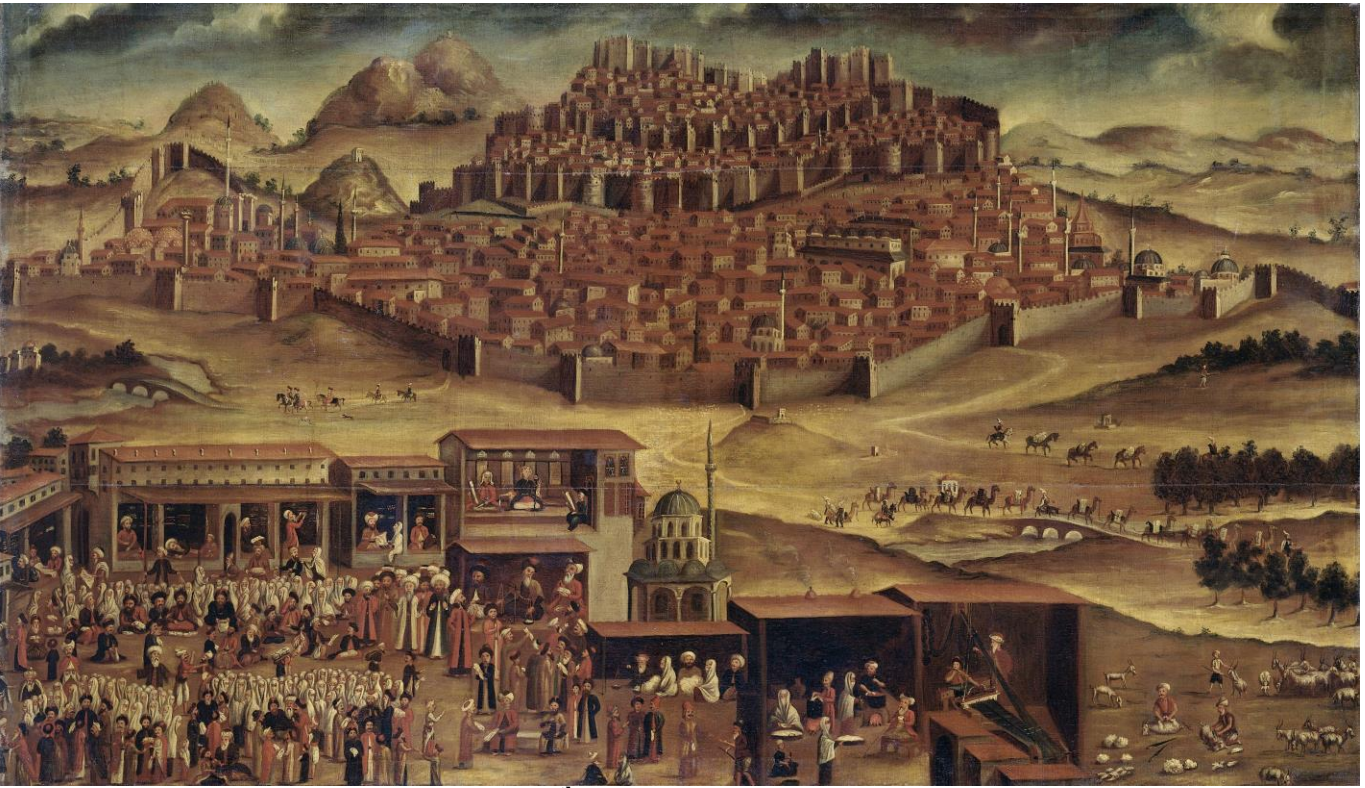
Fig. 3 Anon. artist, "View of Ankara," 18th century, Rijksmuseum