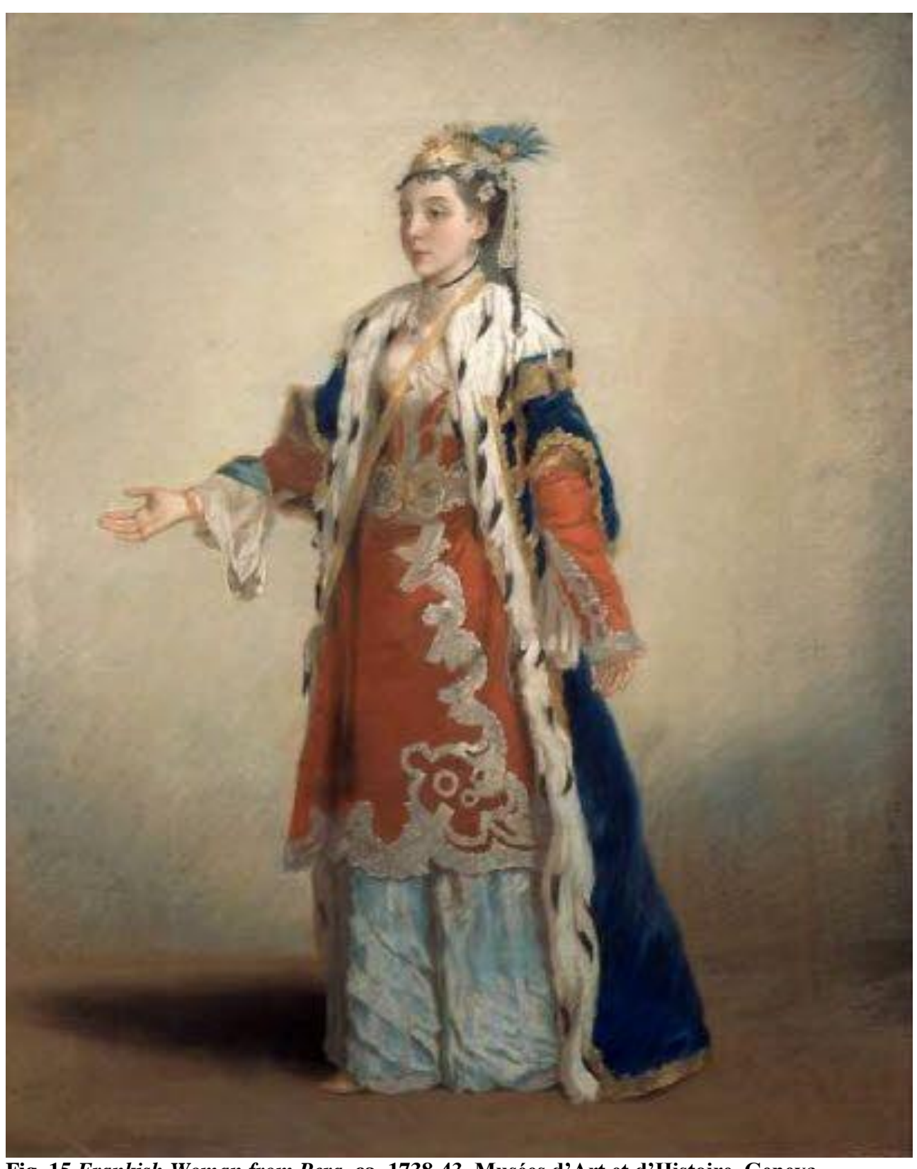
Fig. 15 Frankish Woman from Pera, ca. 1738-43, Musées d'Art et d'Histoire, Geneva