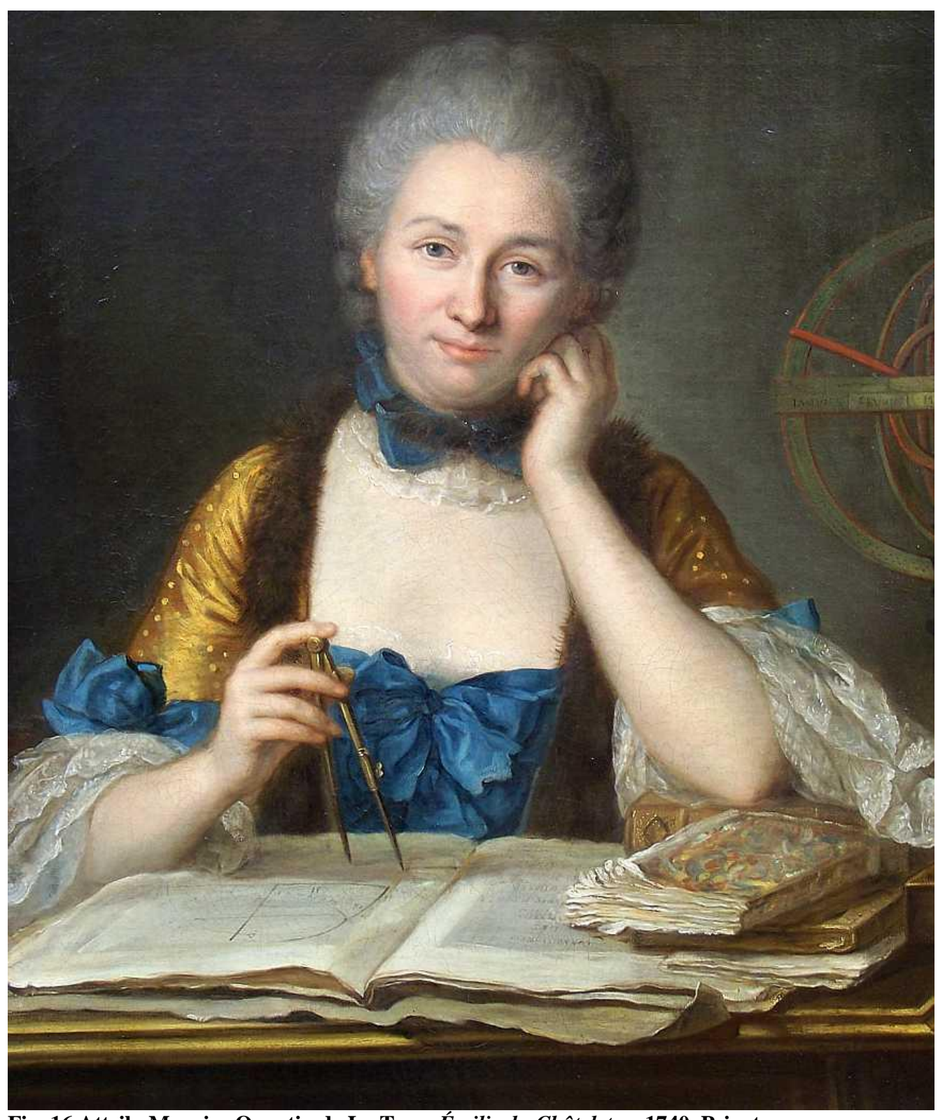
Fig. 16 Attrib. Maurice Quentin de La Tour, Émilie du Châtelet , c. 1740, Private Collection