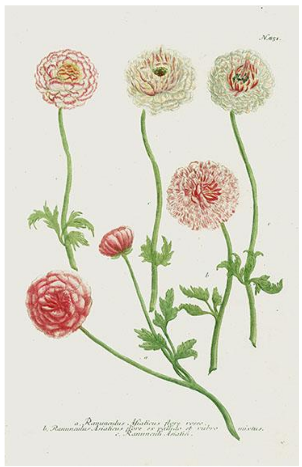
Fig. 6 Ranunculus Asiatici, illustration from Johann Weinmann, Phytanthoza Iconographia, 1737-45