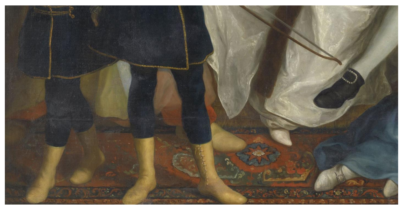
Fig. 4 Detail, Van Lennep Family portrait