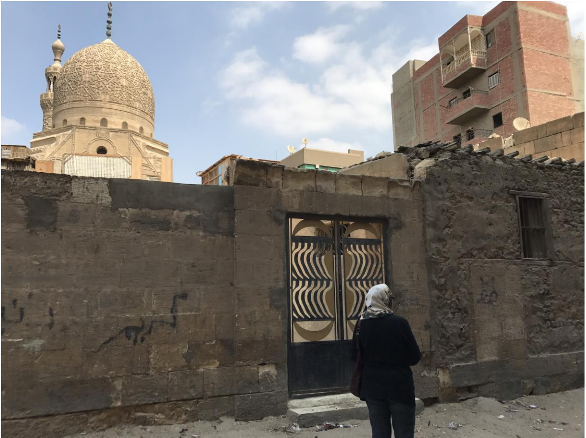
Entrance gates to the mausoleum mosque of Qait Bay, Hawsh, Cairo.