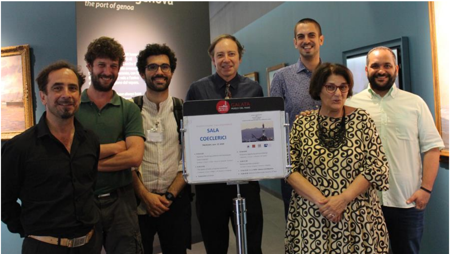
2nd roundtable of LHF-Italy on the occasion of the conference: Between Immigration and Historical Amnesia, 27-29 June 2019, Galata Naval Museum, Genoa, Italy - programme : - gallery :

31st Levantine Heritage Foundation lecture & dinner gathering in London with guest speakers Gareth Winrow: 'Patriot and Liberal Internationalist? The Life of Ahmed Robenson' and Prof Gerald MacLean: 'Ottoman Aleppo Through British Eyes' - 24 July 2019, 6 pm - flyer : - video 1 , 2