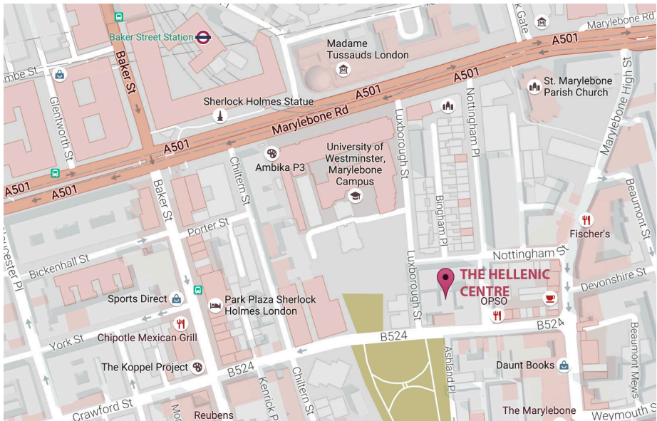
THE HELLENIC CENTRE (W1U 5AS)